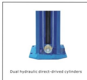
Dual hydraulic direct-driven cylinders