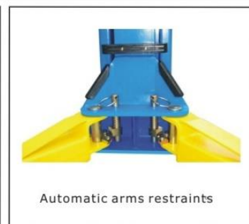
Automatic arms restraints